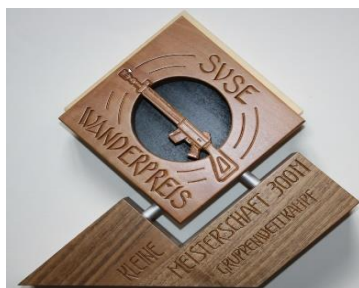
Wanderpreis Gruppe 300m