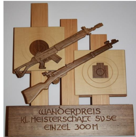
Wanderpreis Einzel 300m