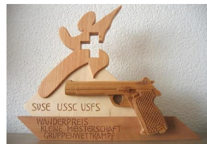
Wanderpreis Gruppe Pistole